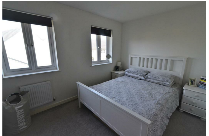
Bedroom 2 13'3" x 7'7" (4.04 x 2.31)