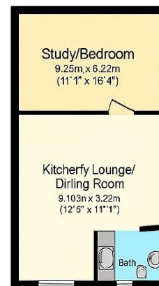
Self contained studio