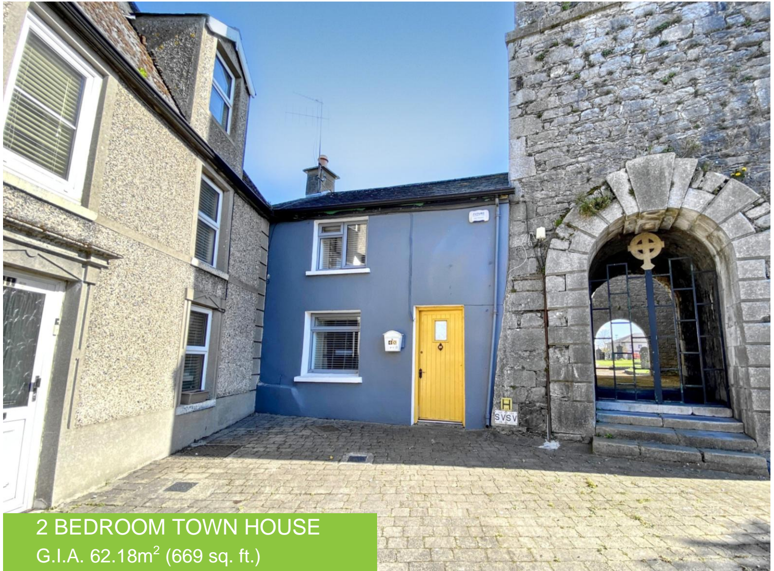
2 BEDROOM TOWN HOUSE G.I.A. 62.18m 2 (669 sq. ft.)