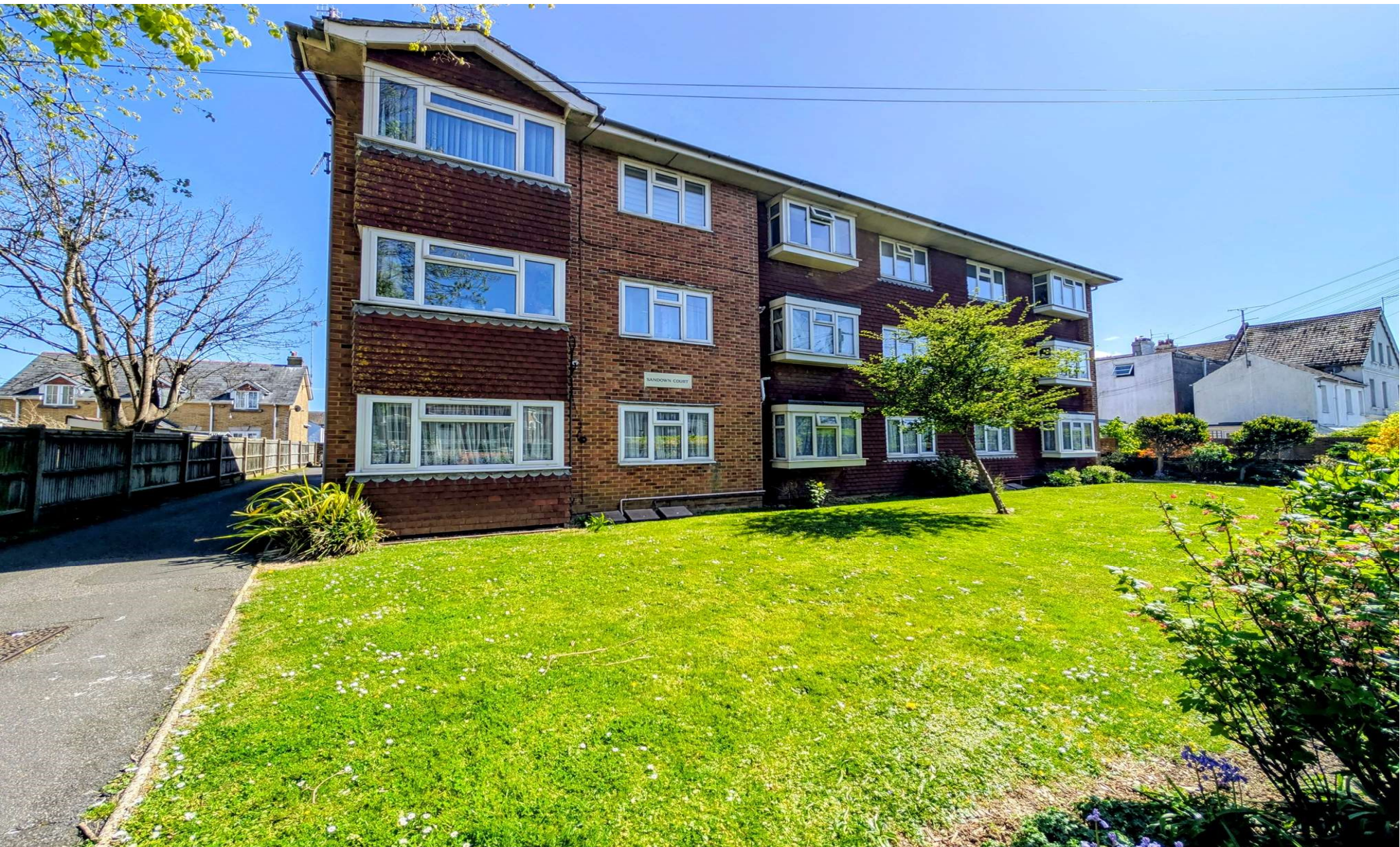
Sandown Court Byron Road, Worthing BN11 3HL