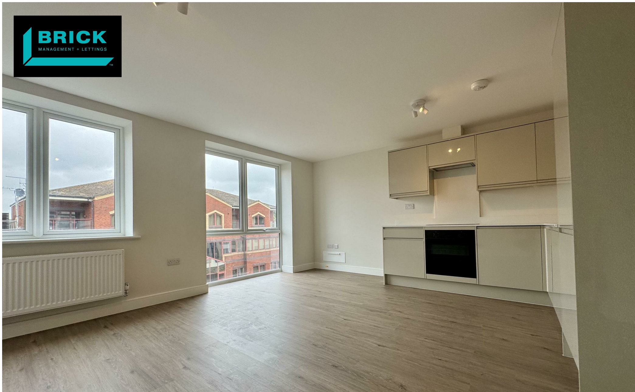
Apartment 13 Old Bank House 34-36 Victoria Road, Farnborough, Hampshire, GU14 7TR £1,290 Per month