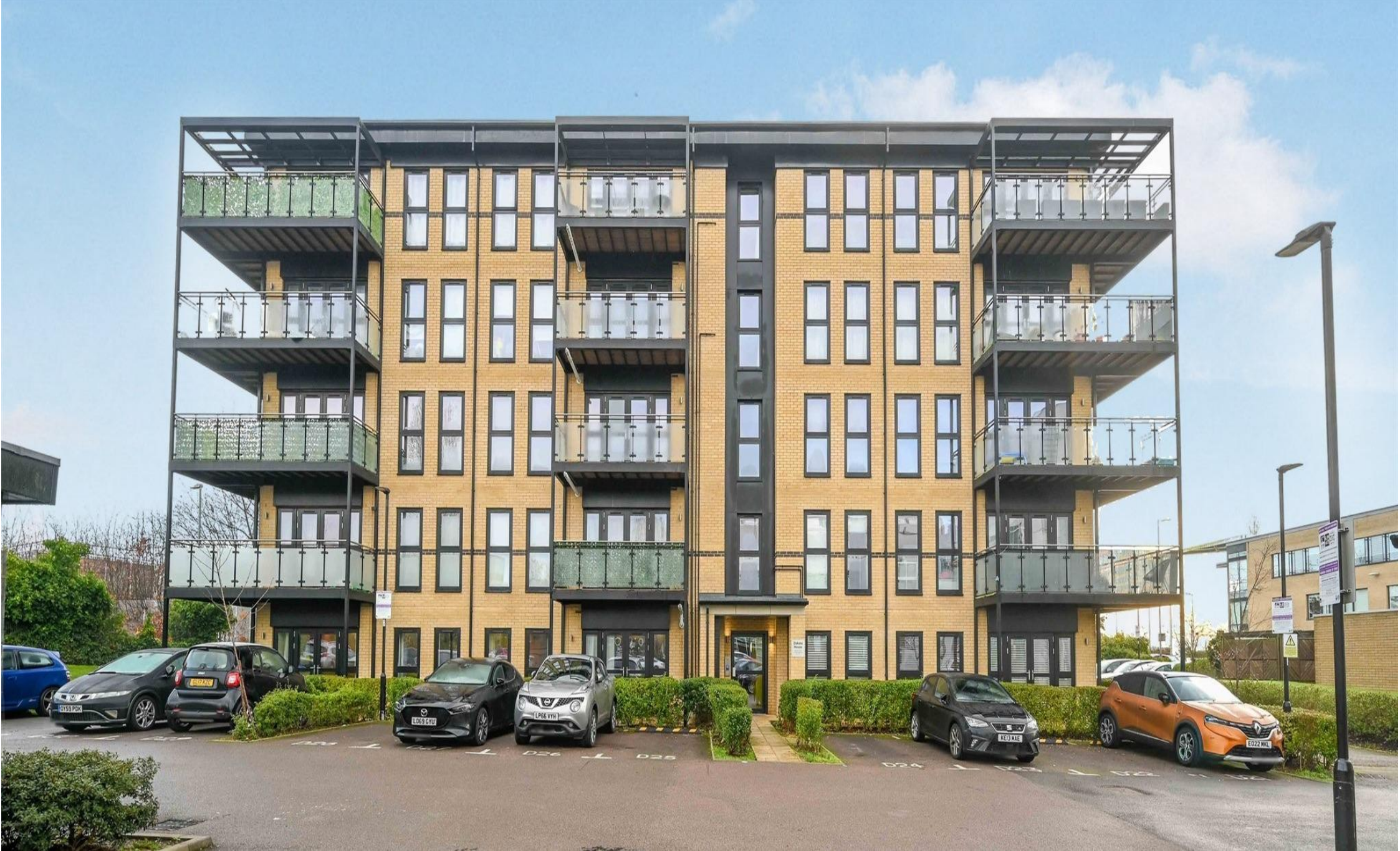
Dakota House Bessemer Road, WELWYN GARDEN CITY AL7 1GJ