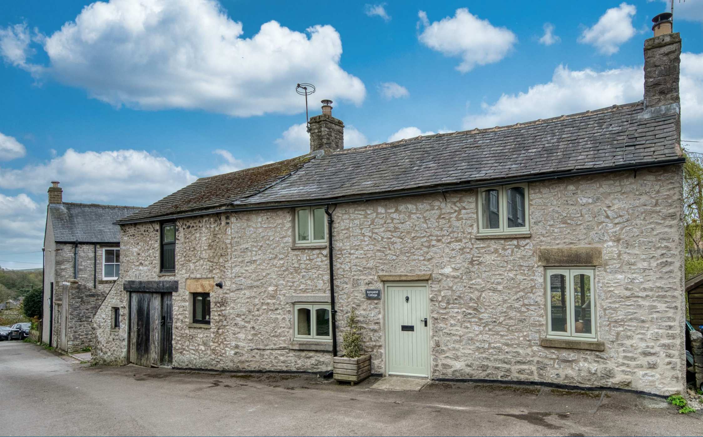
Kempshill Cottage Alma Road, Tideswell, Derbyshire, SK17 8ND