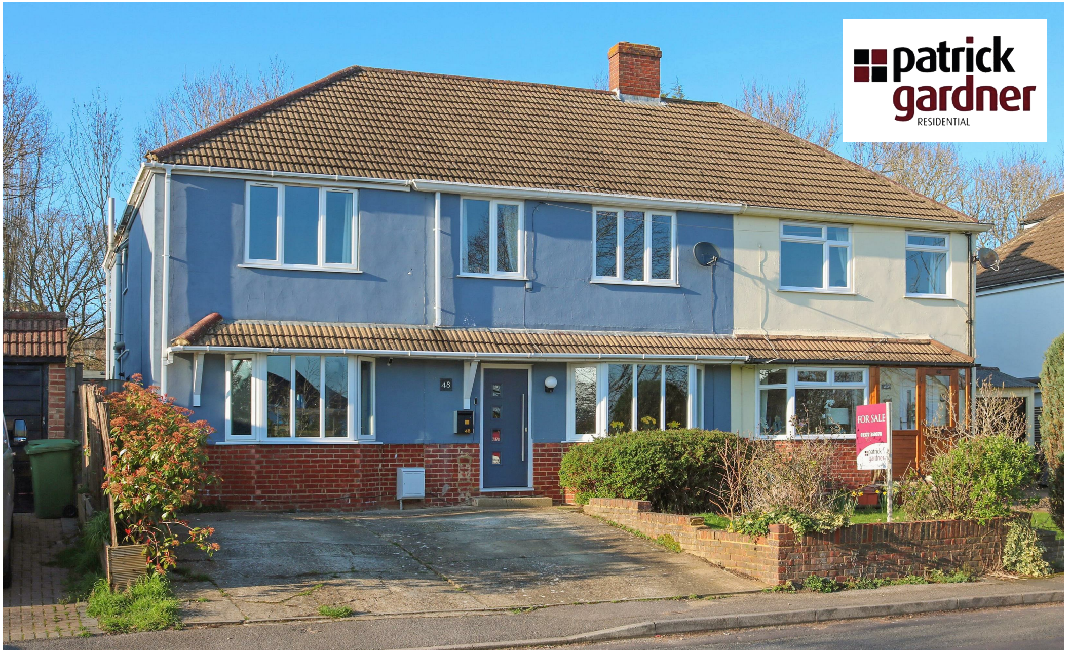
48 Hilley Field Lane, Fetcham, KT22 9UX