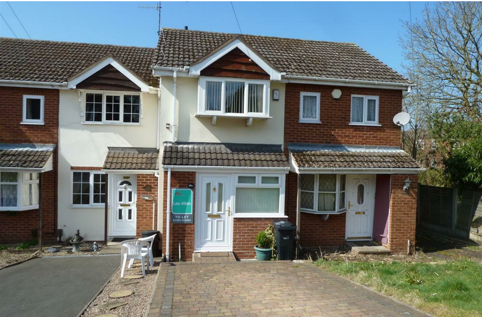
35d Church Street, Brierley Hill DY5 4HB