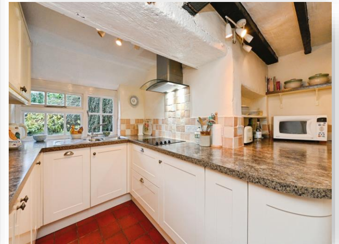
Church Road, Wereham, King's Lynn, PE33 9AP