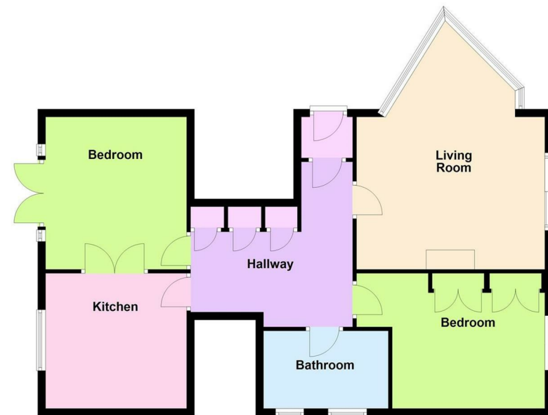
Floor Plan Approx. 89.7 sq. metres (965.0 sq. feet)

Total area: approx. 89.7 sq. metres (965.0 sq. feet)