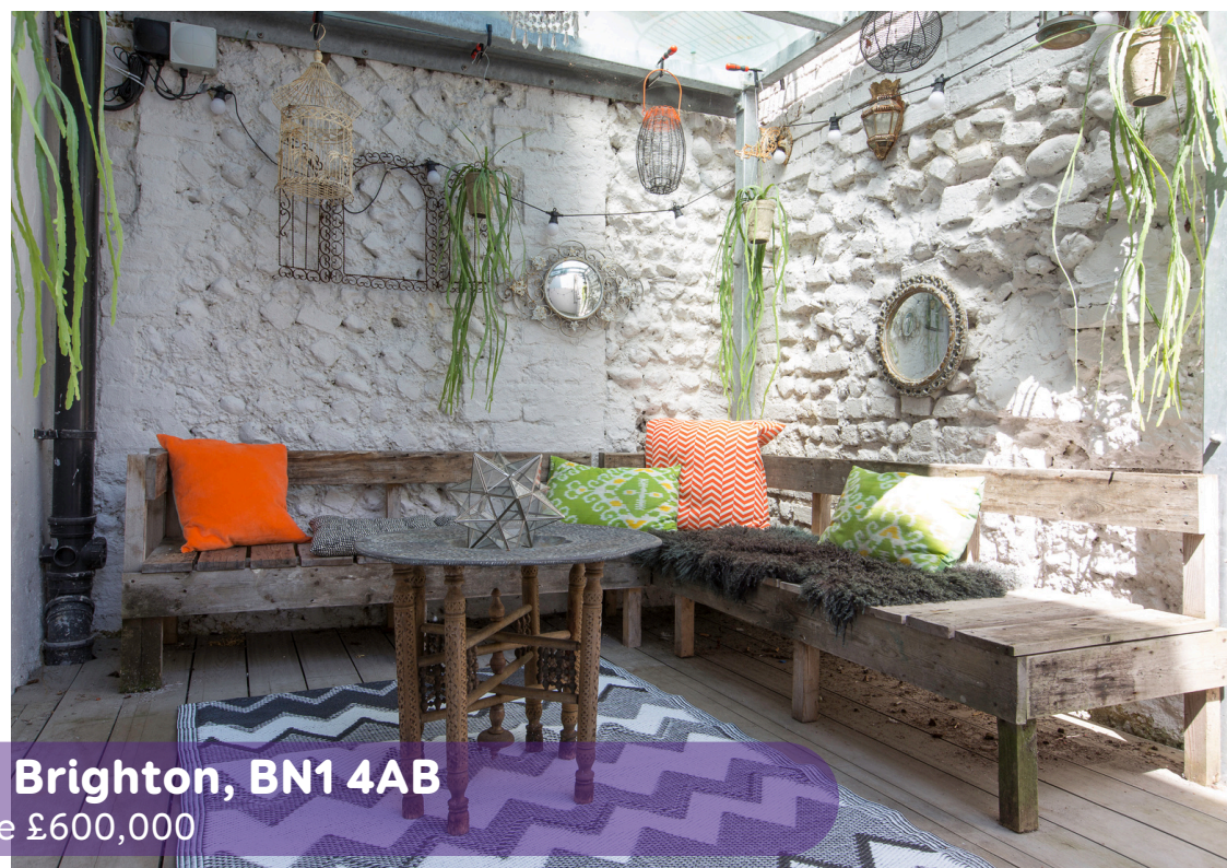
Cheltenham Place, Brighton, BN1 4AB Asking Price £600,000