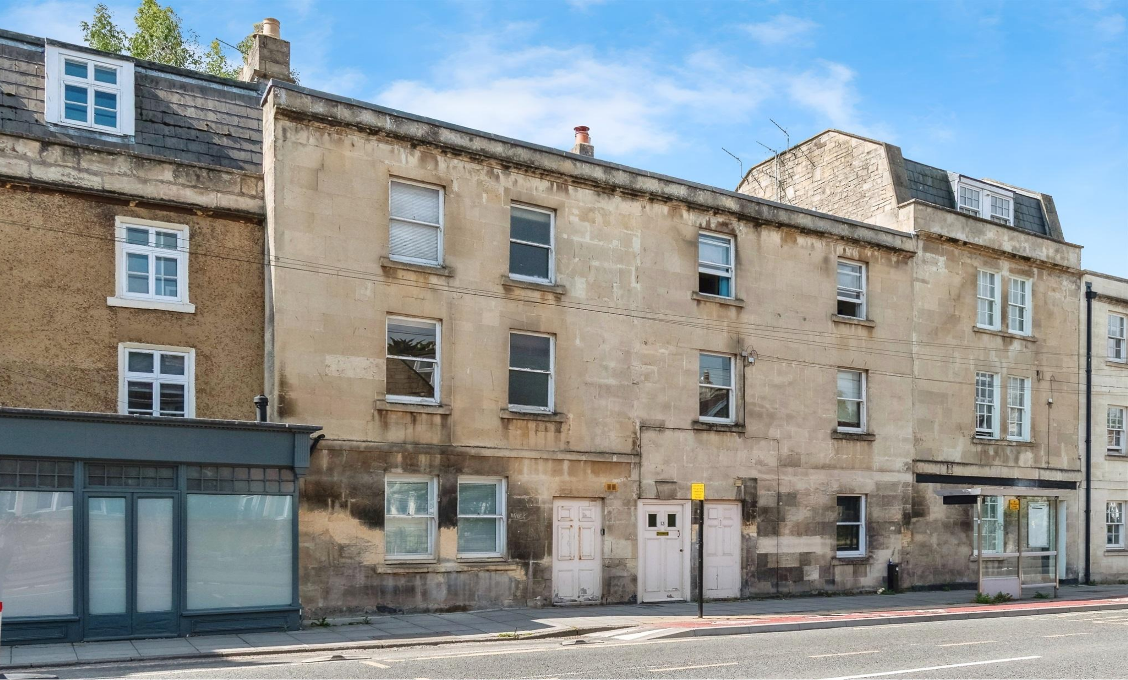
Monmouth Place, Upper Bristol Road Bath BA1 2AX