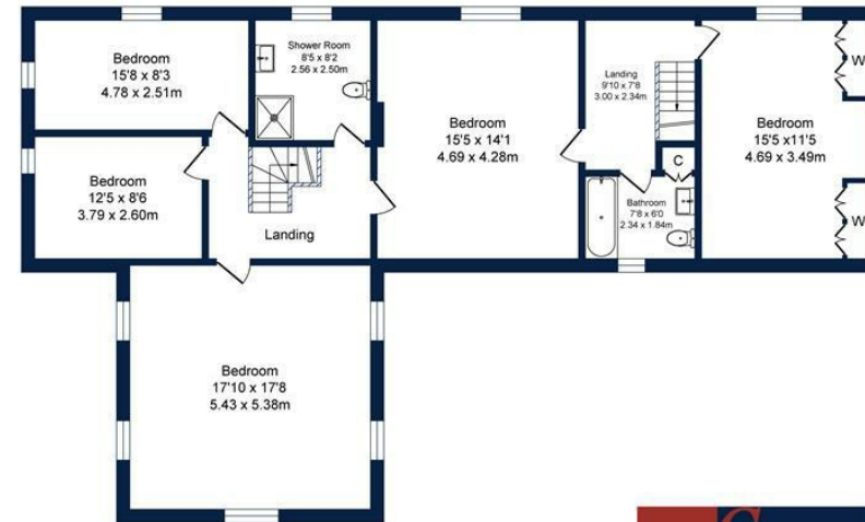
First Floor Approx. Floor Area 1395 Sq.Ft (129.6 Sq.M.)