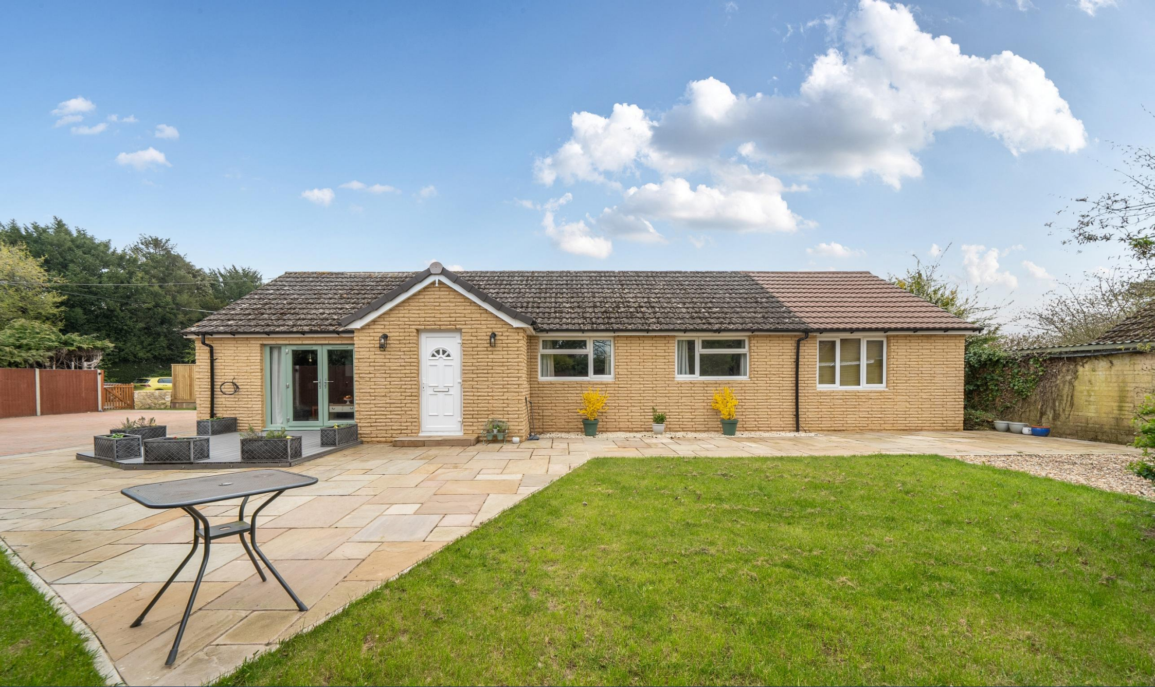
Heather Cottage, Juniper Hill, Brackley, Northamptonshire, NN13 5RH