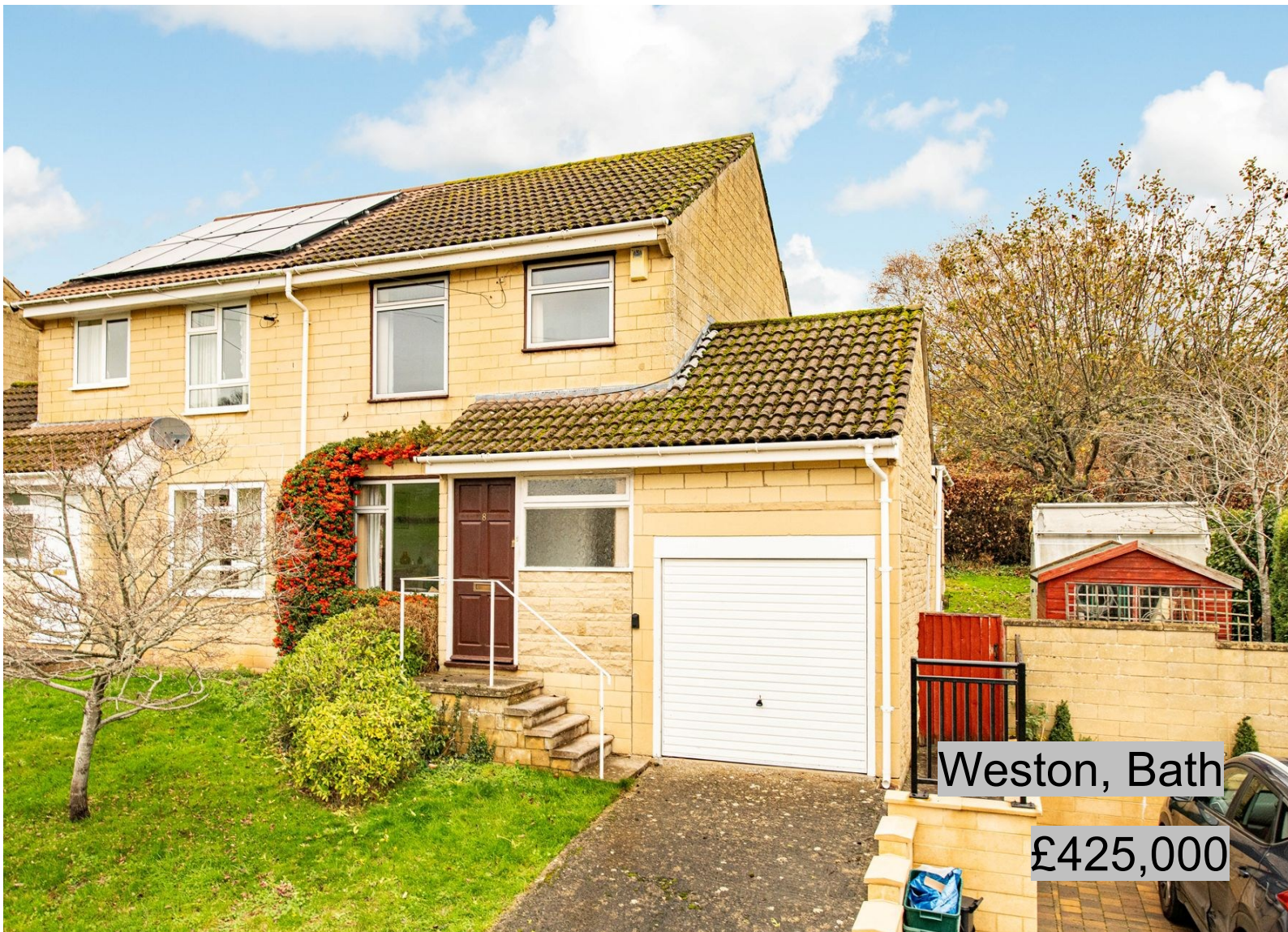
An Extended 1970's Three Bedroom Semi. Beautiful Views. EPC Grade D