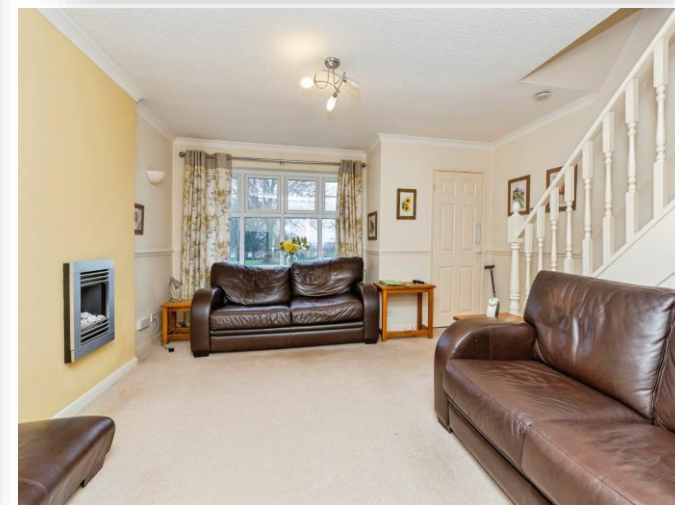
Amberwood Walk, Hartlepool, TS27 3QG