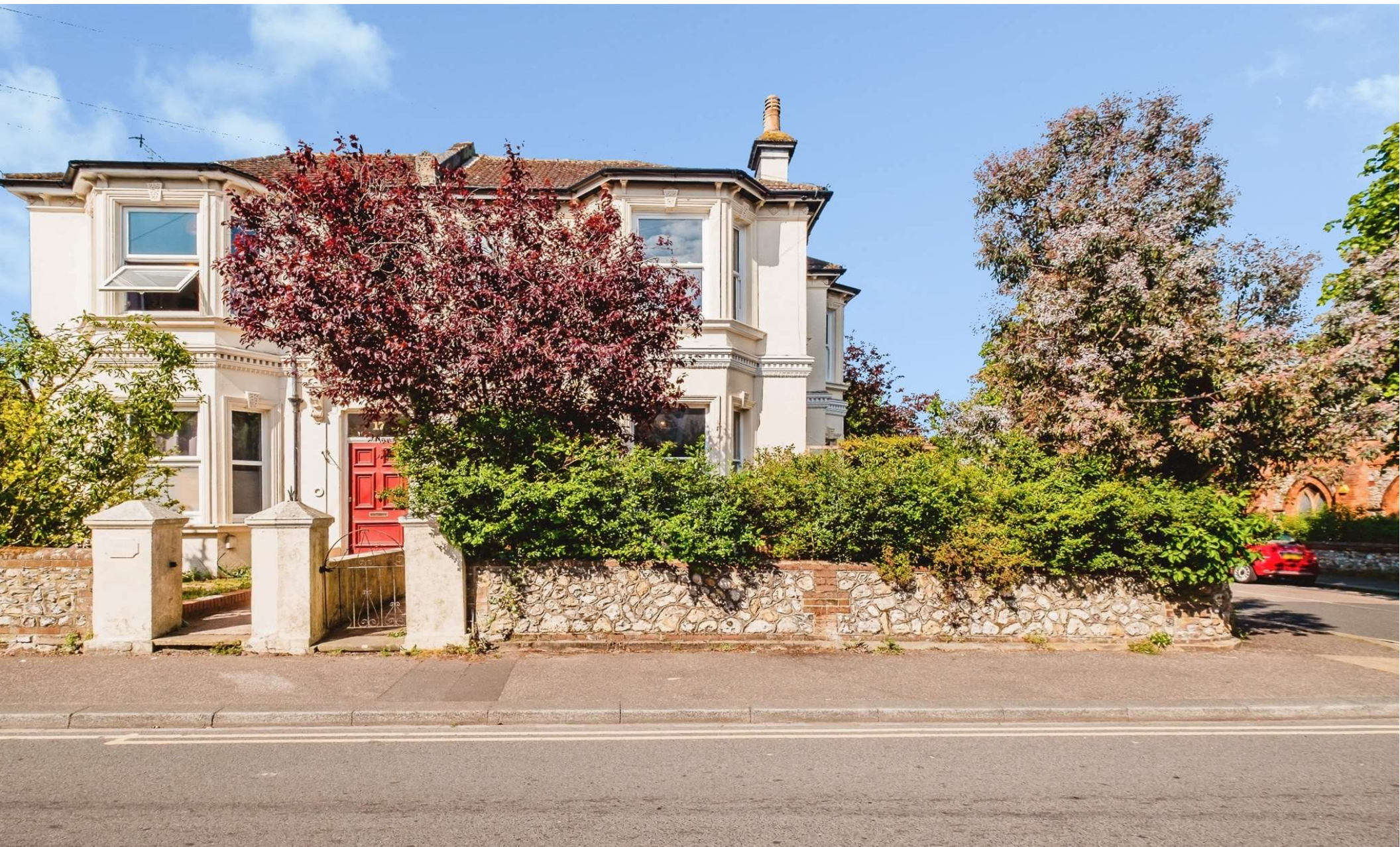
Christchurch Road, WORTHING BN11 1JH