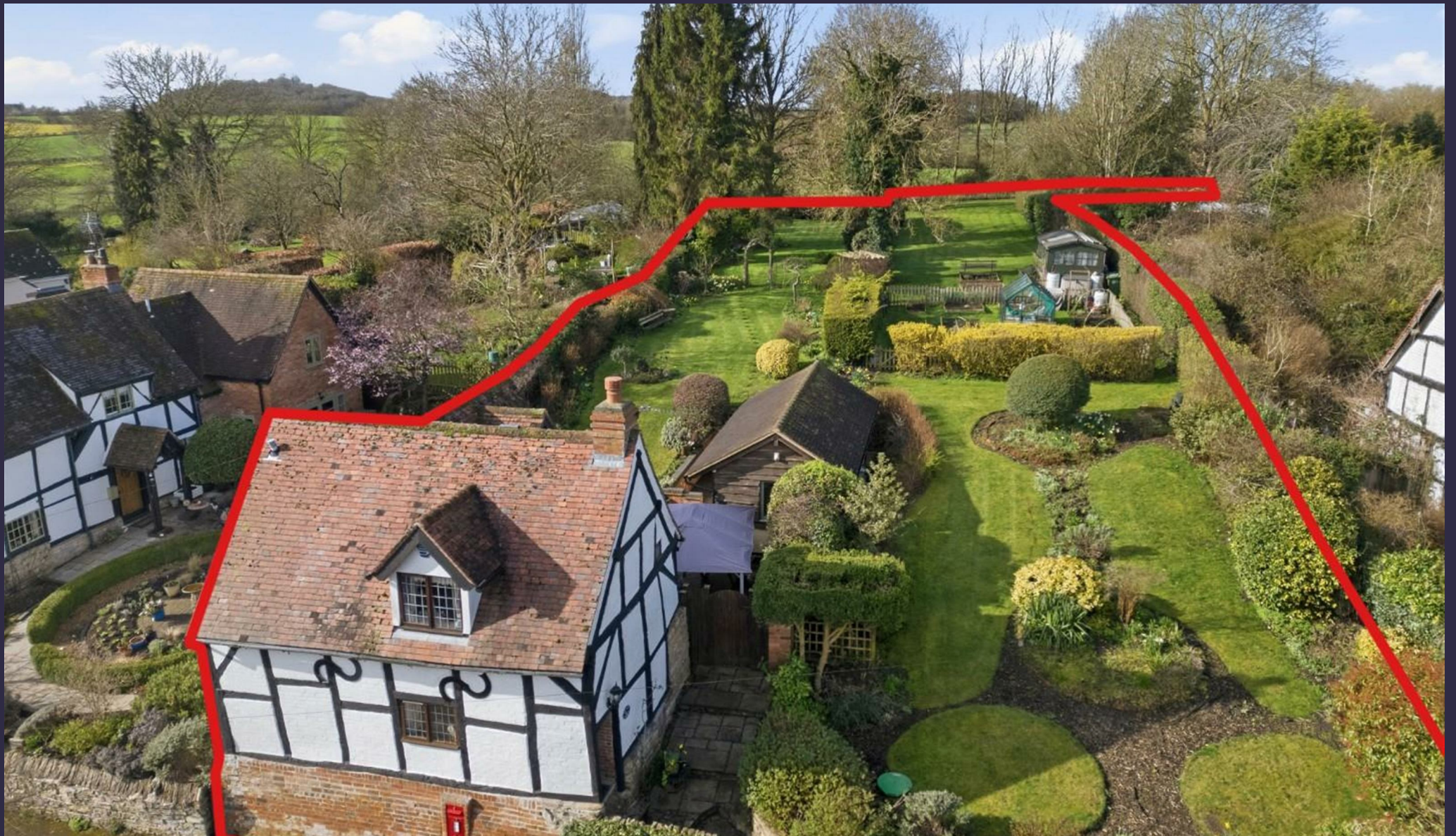
Bexley Cottage, Haselor, Alcester, B49 6LU