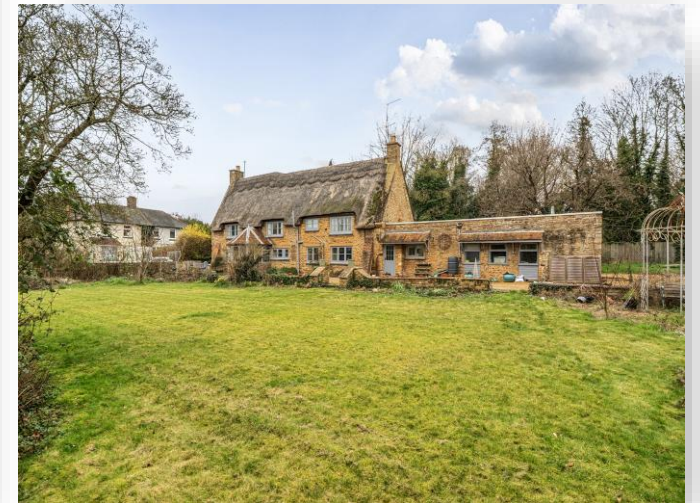
Church Lane Cottage, Church Lane, Little Billing, Northampton NN3 9AF