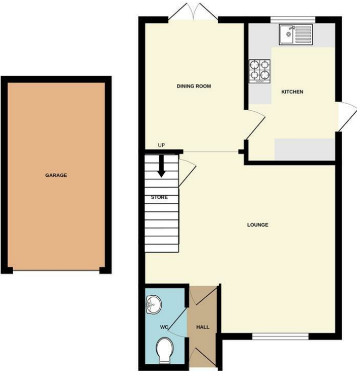
GROUND FLOOR 623 sq.ft. (57.9 sq.m.) approx.