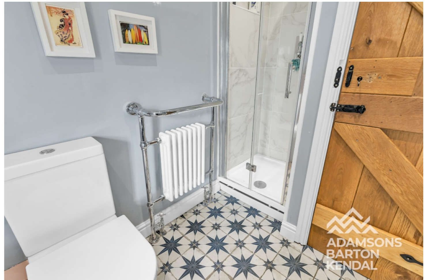
Healey Lane, Lower Healey, Shawclough OL12 0TA