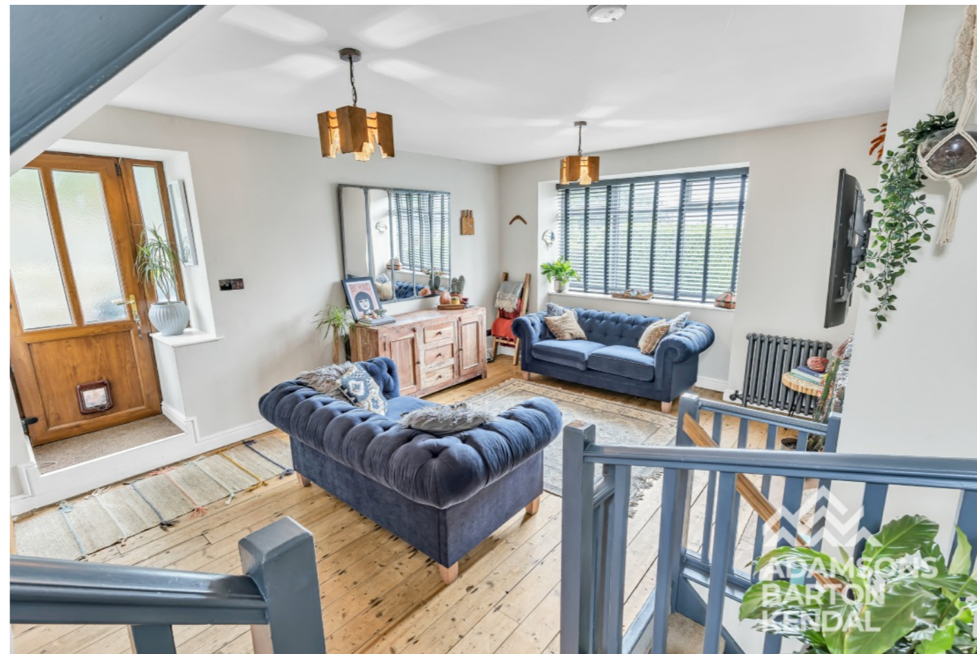
Healey Lane, Lower Healey, Shawclough OL12 0TA