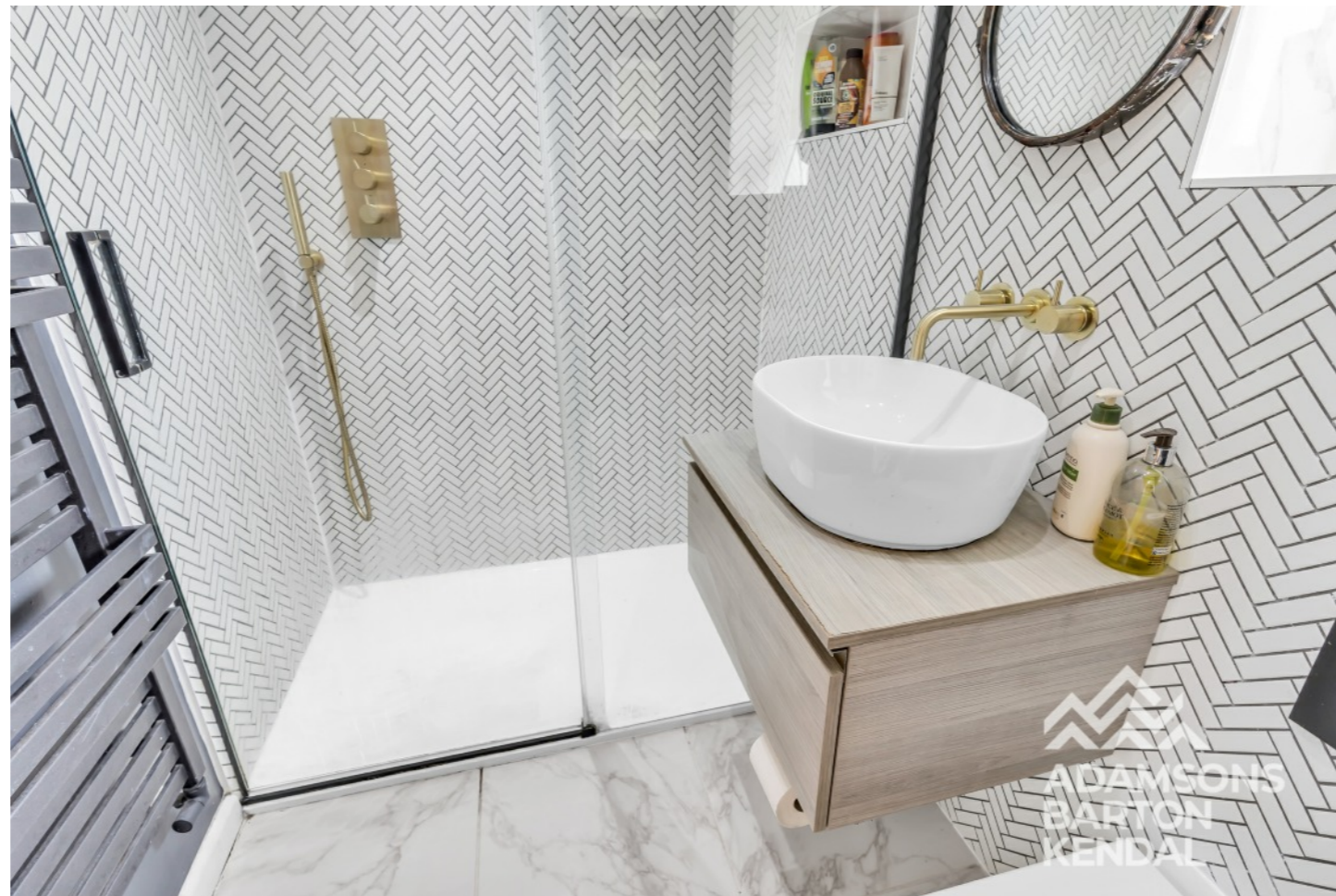
Healey Lane, Lower Healey, Shawclough OL12 0TA