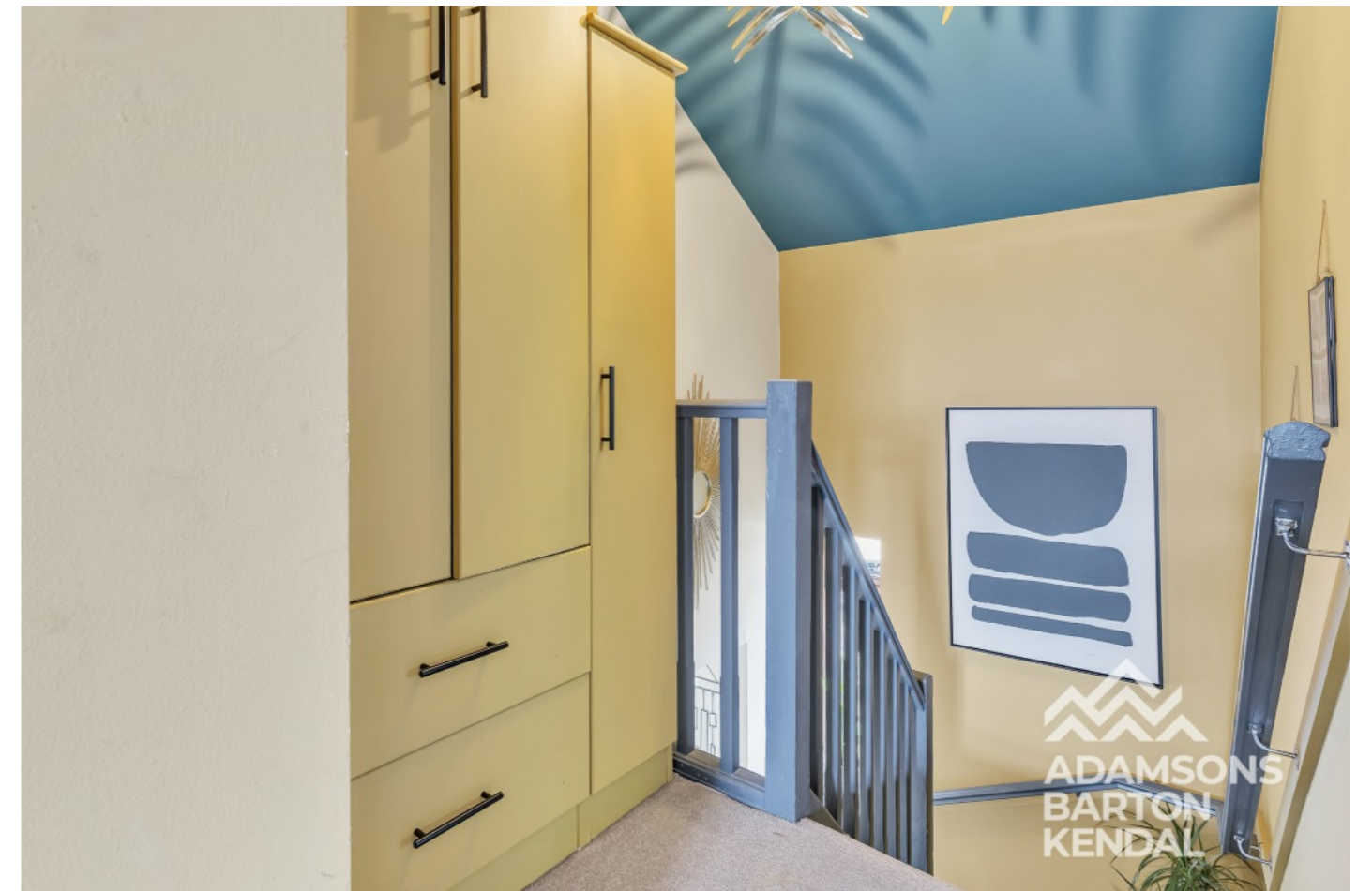
Healey Lane, Lower Healey, Shawclough OL12 0TA