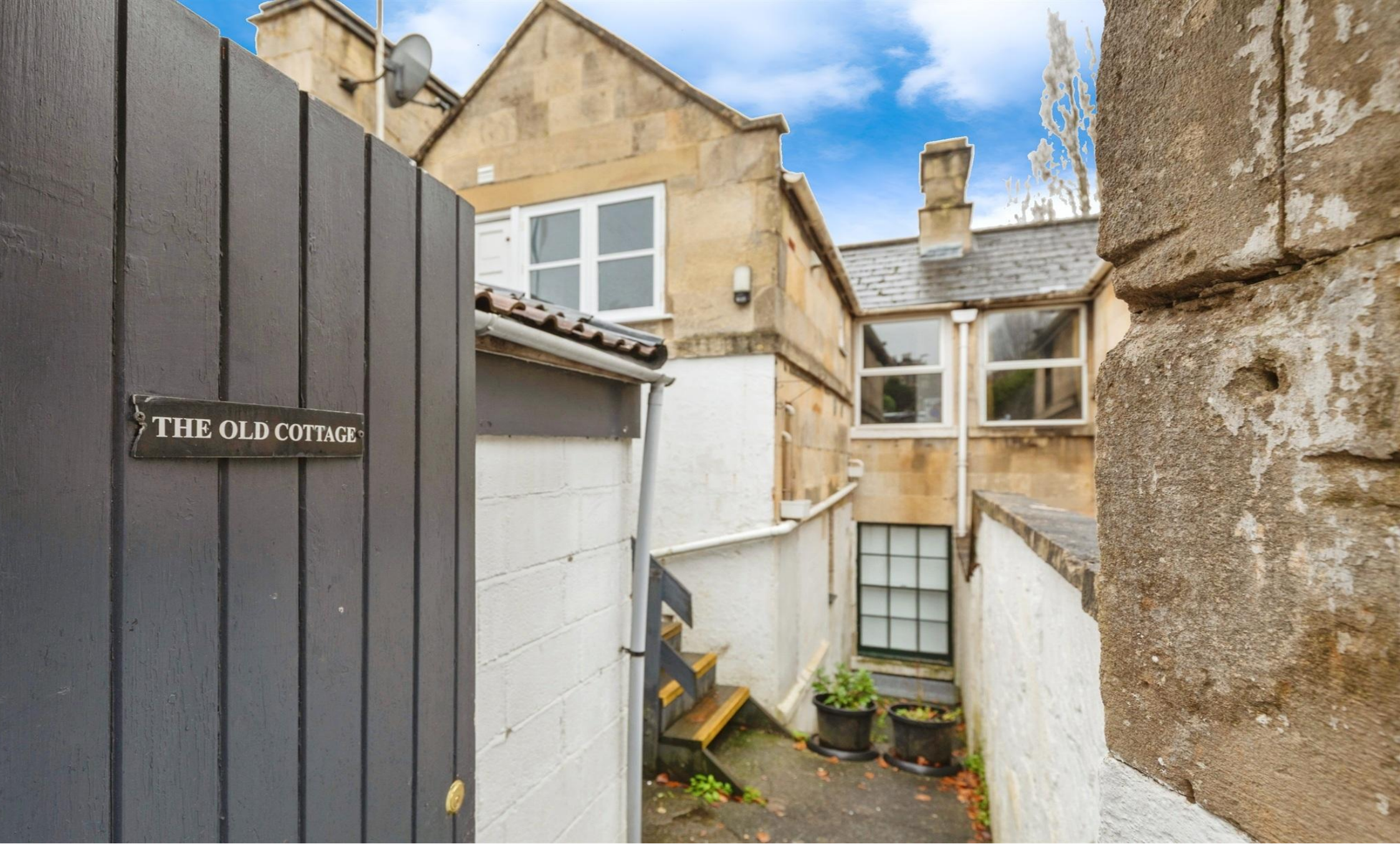
The Old Cottage, St. Saviours Road, Larkhall, Bath, BA1 6RJ