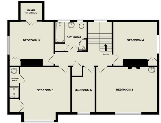
TOTAL FLOOR AREA : 2062 sq.ft. (191.6 sq.m.) approx.

Whilst every attempt has been made to ensure the accuracy of the floorplan contained here, measurements of doors, windows, rooms and any other items are approximate and no responsibility is taken for any error, omission or mis-statement. This plan is for illustrative purposes only and should be used as such by any prospective purchaser. The services, systems and appliances shown have not been tested and no guarantee as to their operability or efficiency can be given. Made with Metropix ©2026