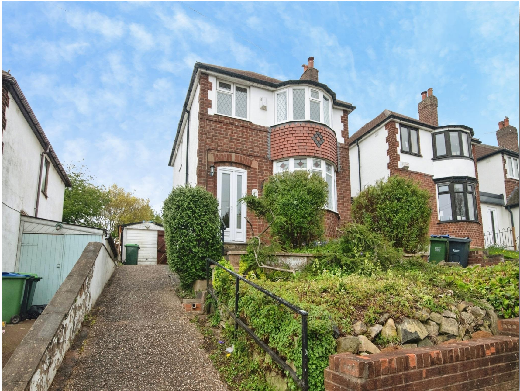
Regent Road, Tividale Oldbury B69 1TL