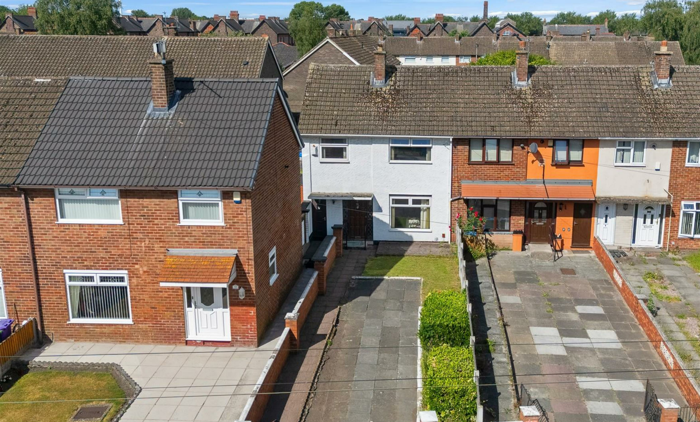
Haven Road, Fazakerley, Liverpool, L10 1LR