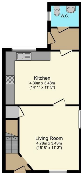
Ground Floor Floor area 42.8 sq.m. (460 sq.ft.)