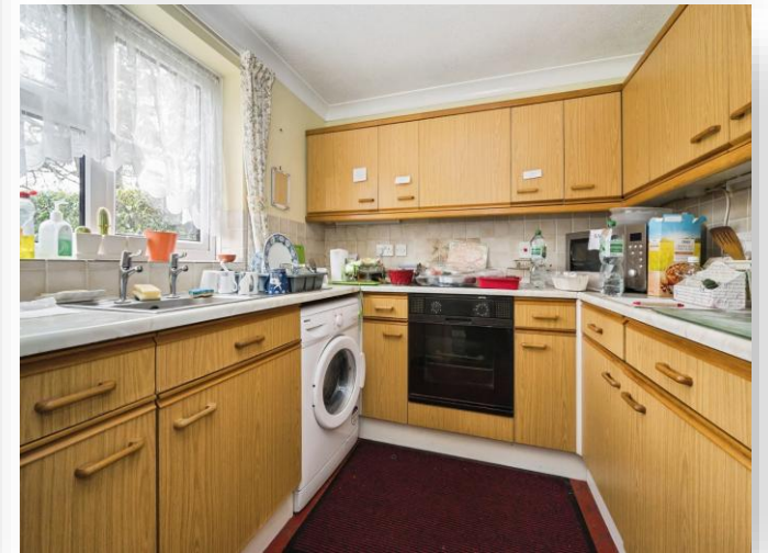
Campbell Mews, Pine Drive, Southampton SO18 5RP