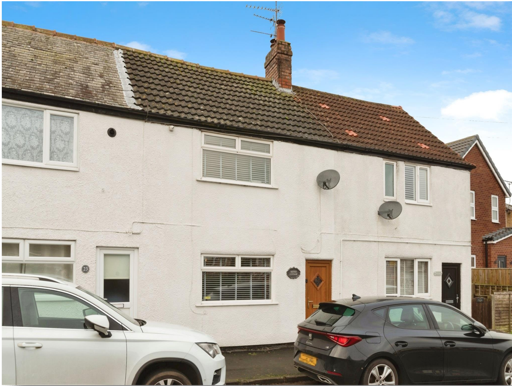
Middle Cottage Station Road, Keyingham, Hull, HU12 9SZ