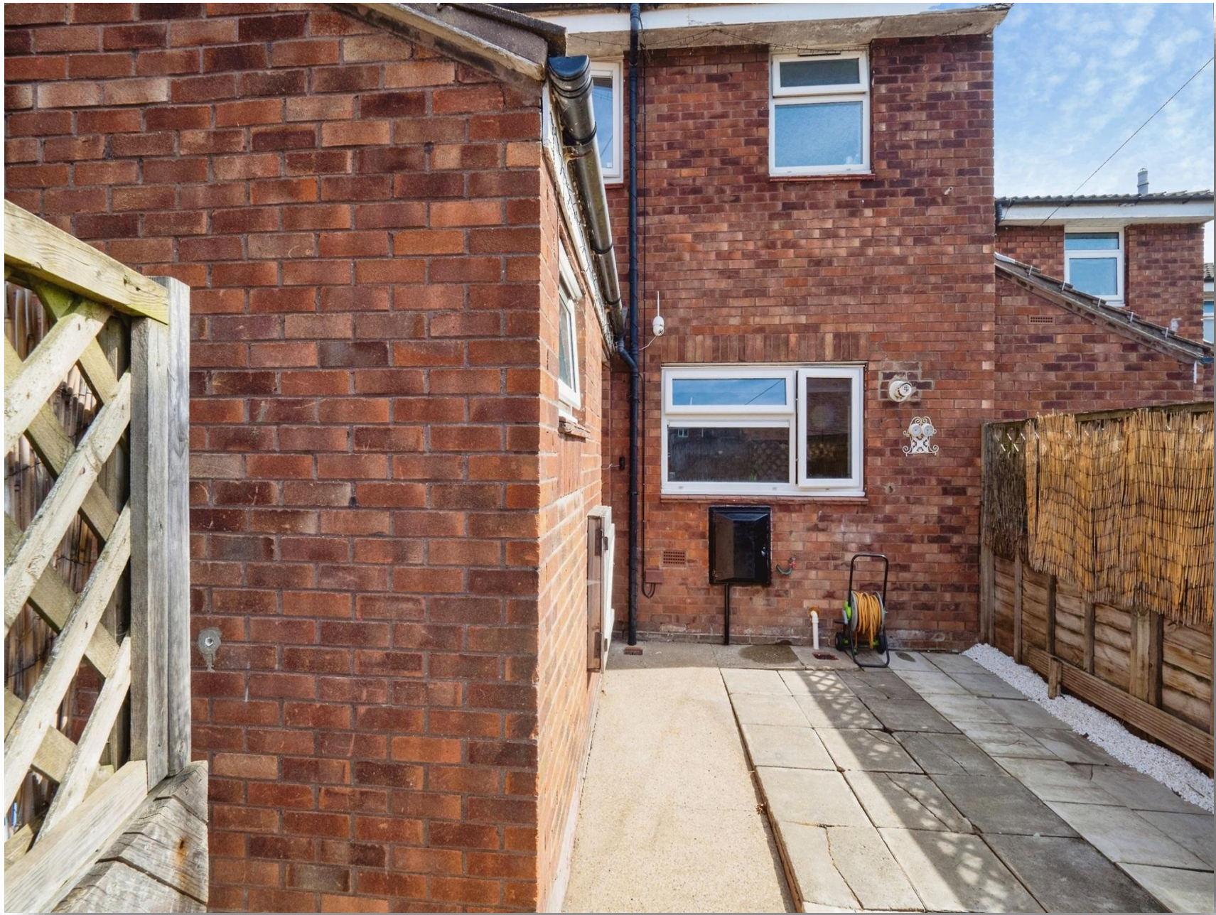
Curlew Close, Bransholme, Hull, HU7 4SY