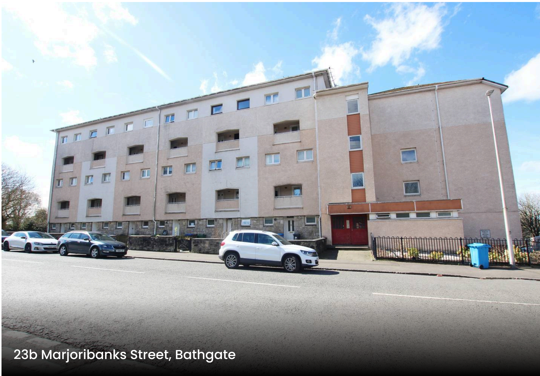
23b Marjoribanks Street, Bathgate