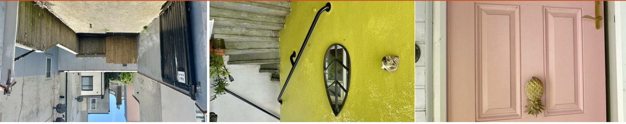
Flat 1, 12 Villa Road, St. Leonards-On-Sea, TN37 6EJ