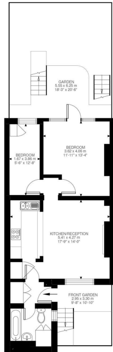
Lower Ground Floor 589 ft 2

Garden Flat, W14 Approximate Gross Internal Area 54.74 SQ.M / 589 SQ.FT