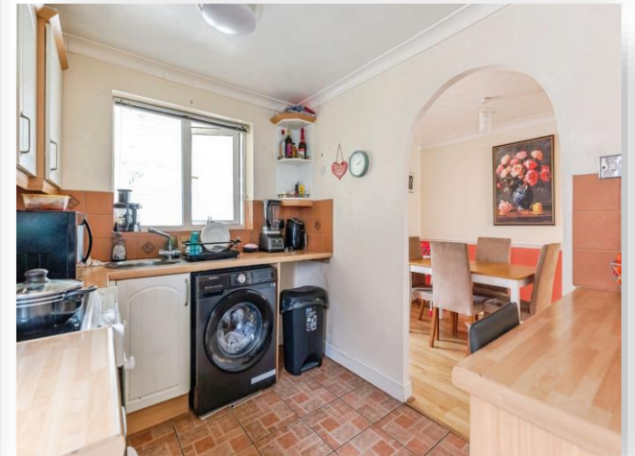
Tyne Close, Wellingborough NN8 5WT