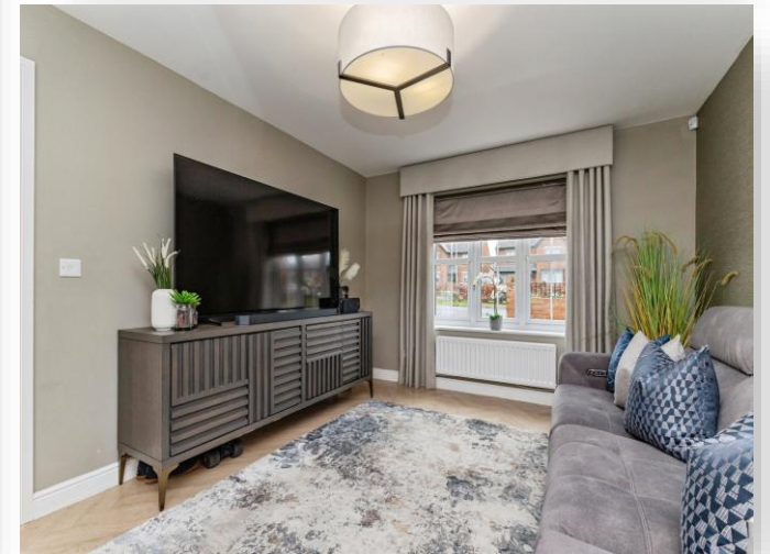
Plough Grange, Middlesbrough TS5 8FQ