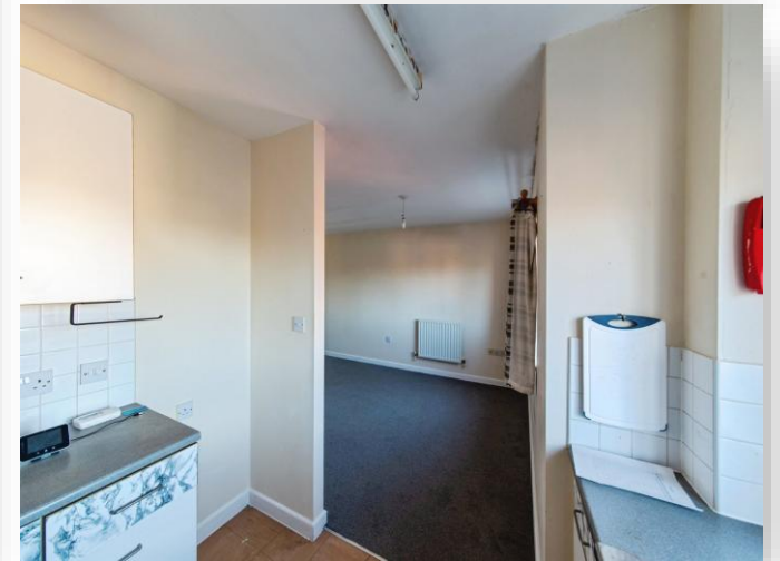
Flat 5 Ayscough Avenue, Spalding PE11 2QB