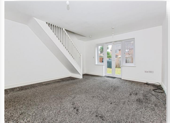
Sayers Crescent, Wisbech St. Mary, Wisbech PE13 4AS