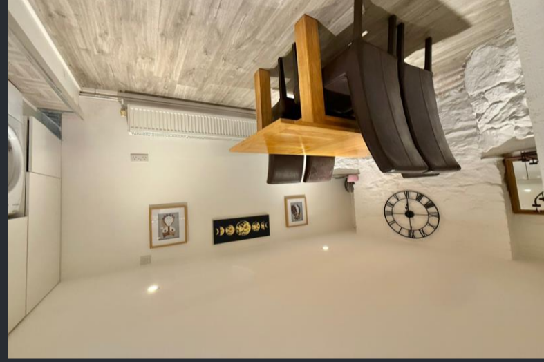
Approx Floor Area: 36.2 m 2 ... 390 ft 2