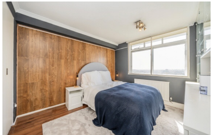
Notting Hill Gate, W11