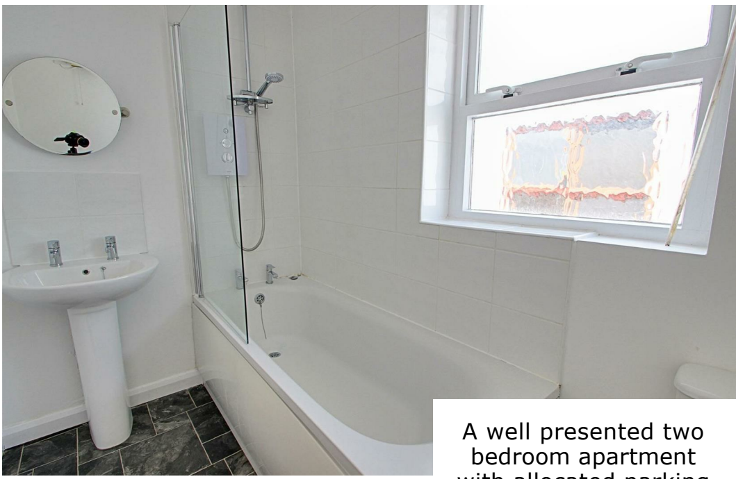
A well presented two bedroom apartment with allocated parking and no upper chain.