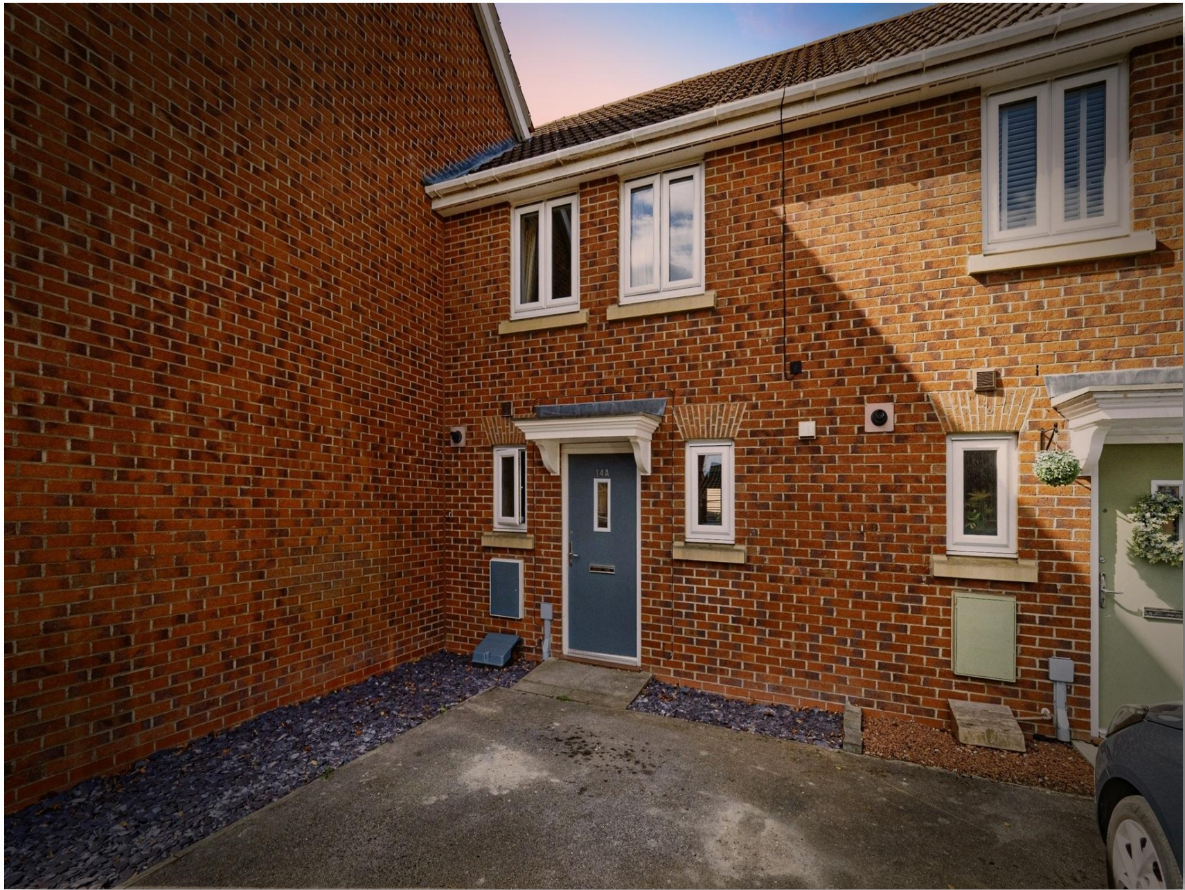
14a Woodheys Park, Kingswood, Hull, HU7 3AJ