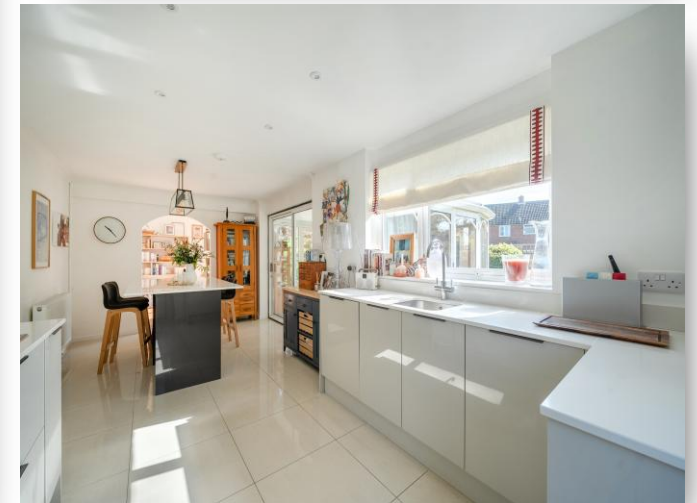
16 Ashley Park, Maidenhead SL6 8EZ