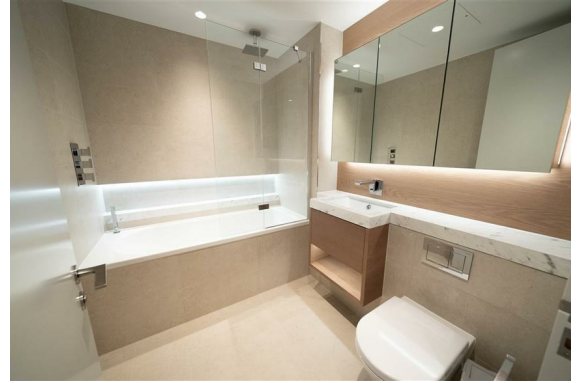
CANALSIDE WALK, W2 Approx. gross internal area 525 Sq.Ft. / 48.8 Sq.M.