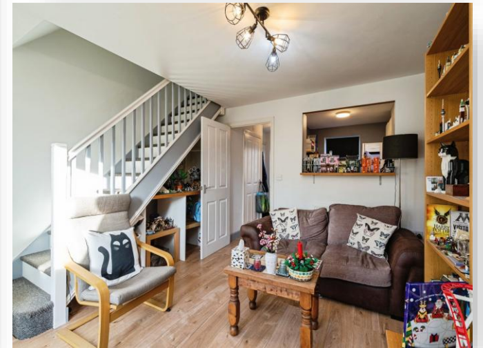
Washington Drive, Watton Thetford IP25 6GY