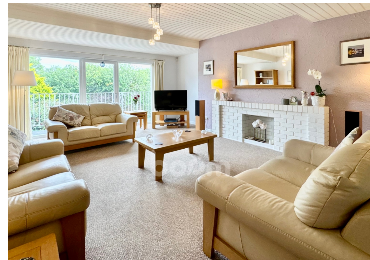
North Street, Dalry