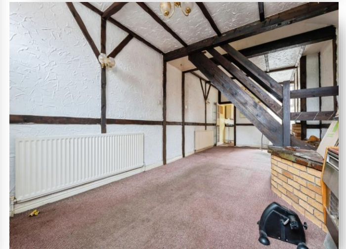
Raymond Road, Leicester LE3 2AT