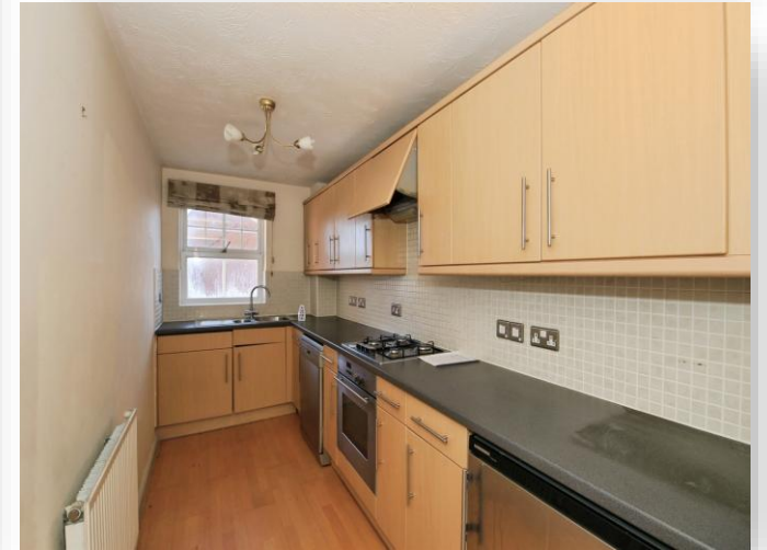
East Water Crescent, Hampton Vale Peterborough PE7 8LU