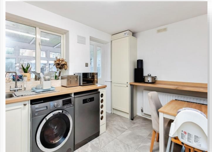
John Clare Court, KETTERING NN16 9UJ