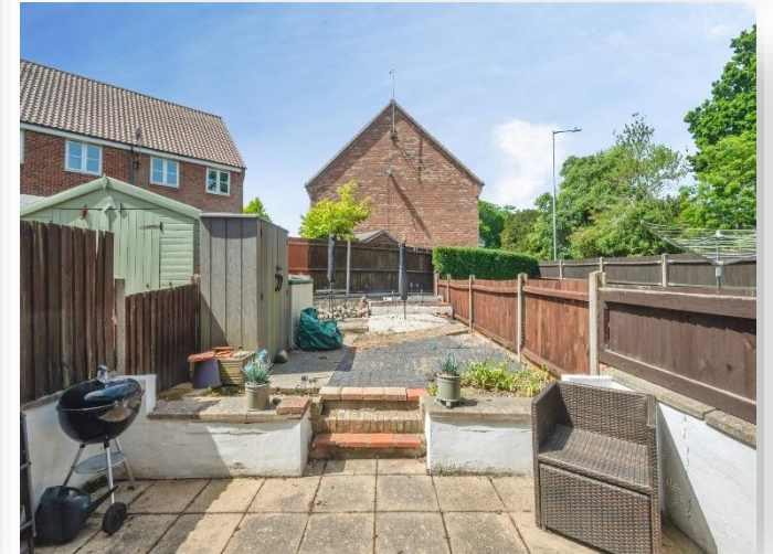
Birch Close, North Walsham NR28 0UD