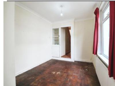
Lounge 10' 11" x 10' 5" ( 3.33m x 3.17m )