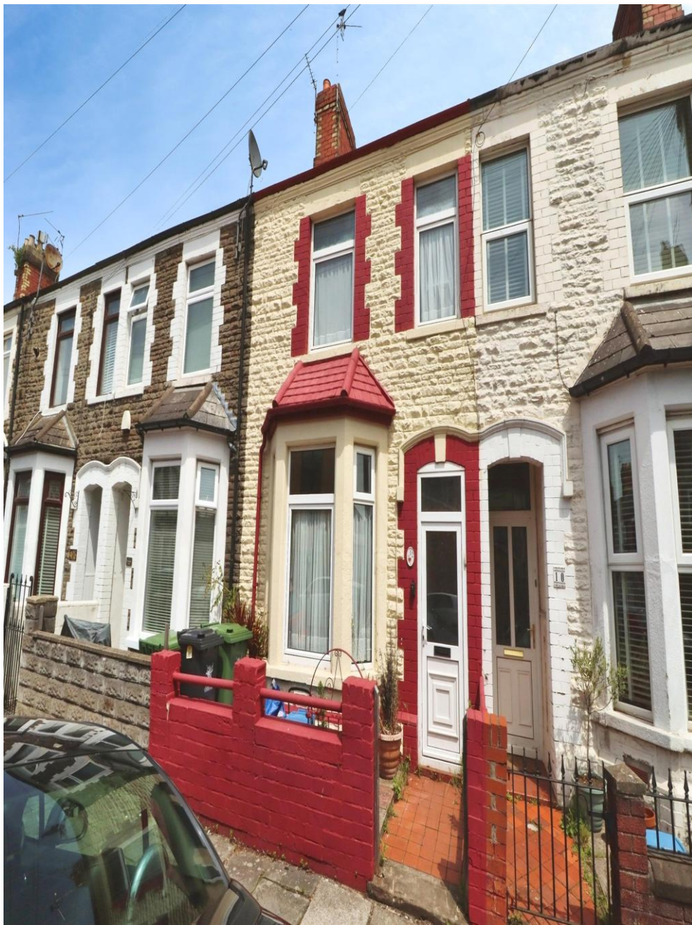
Aldsworth Road, Cardiff CF5 1AA