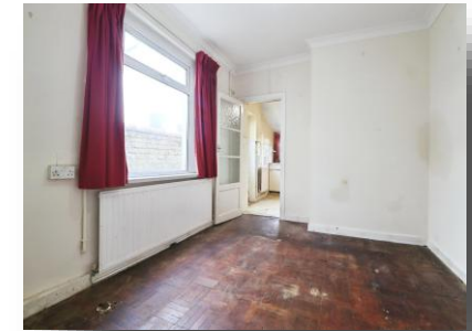
Bedroom 3 11' 1" x 9' 6" ( 3.38m x 2.90m )

view this property online allenandharris.co.uk/Property/CTN110054